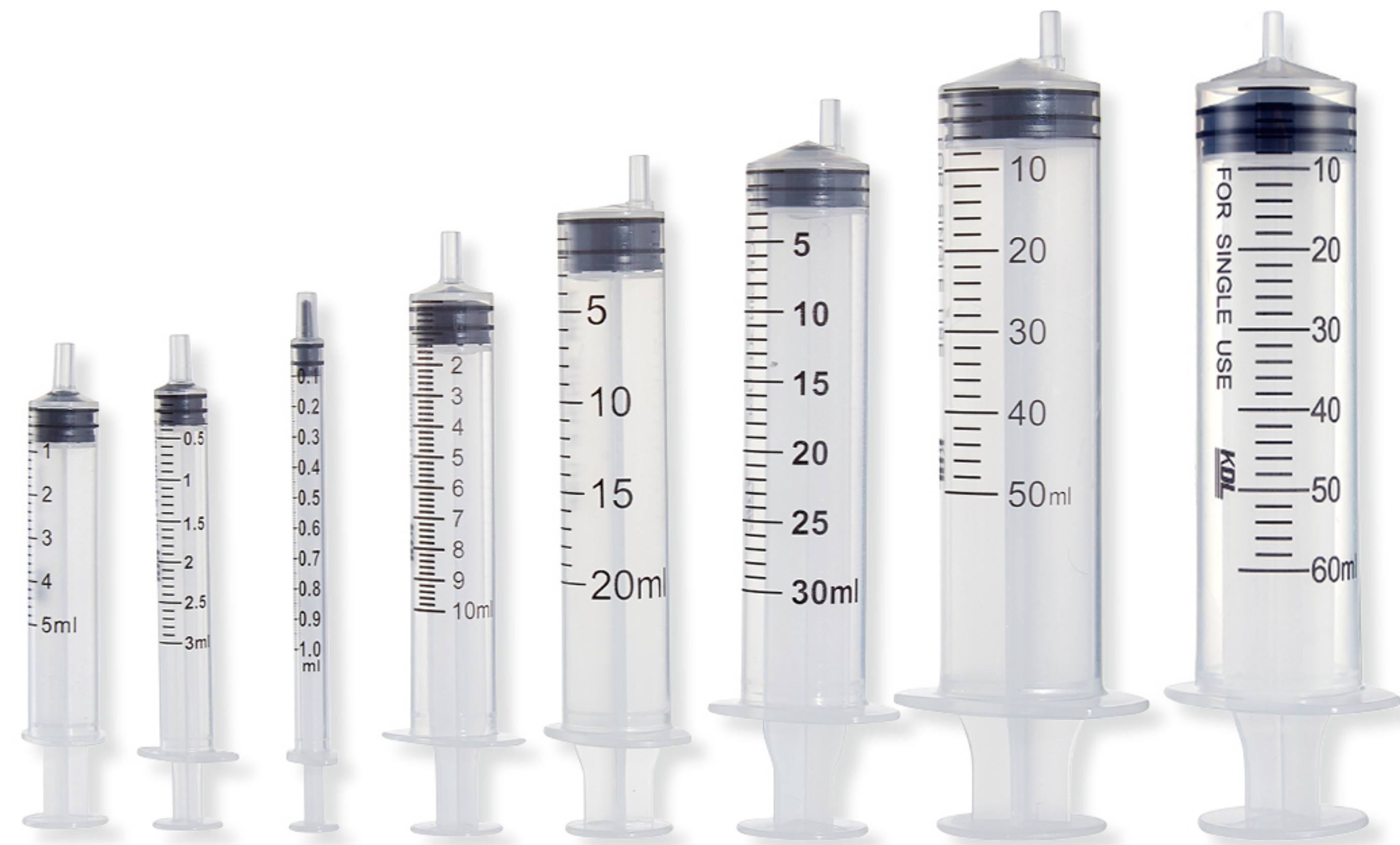
Sterile Syringes for Single Use (Luer Slip)