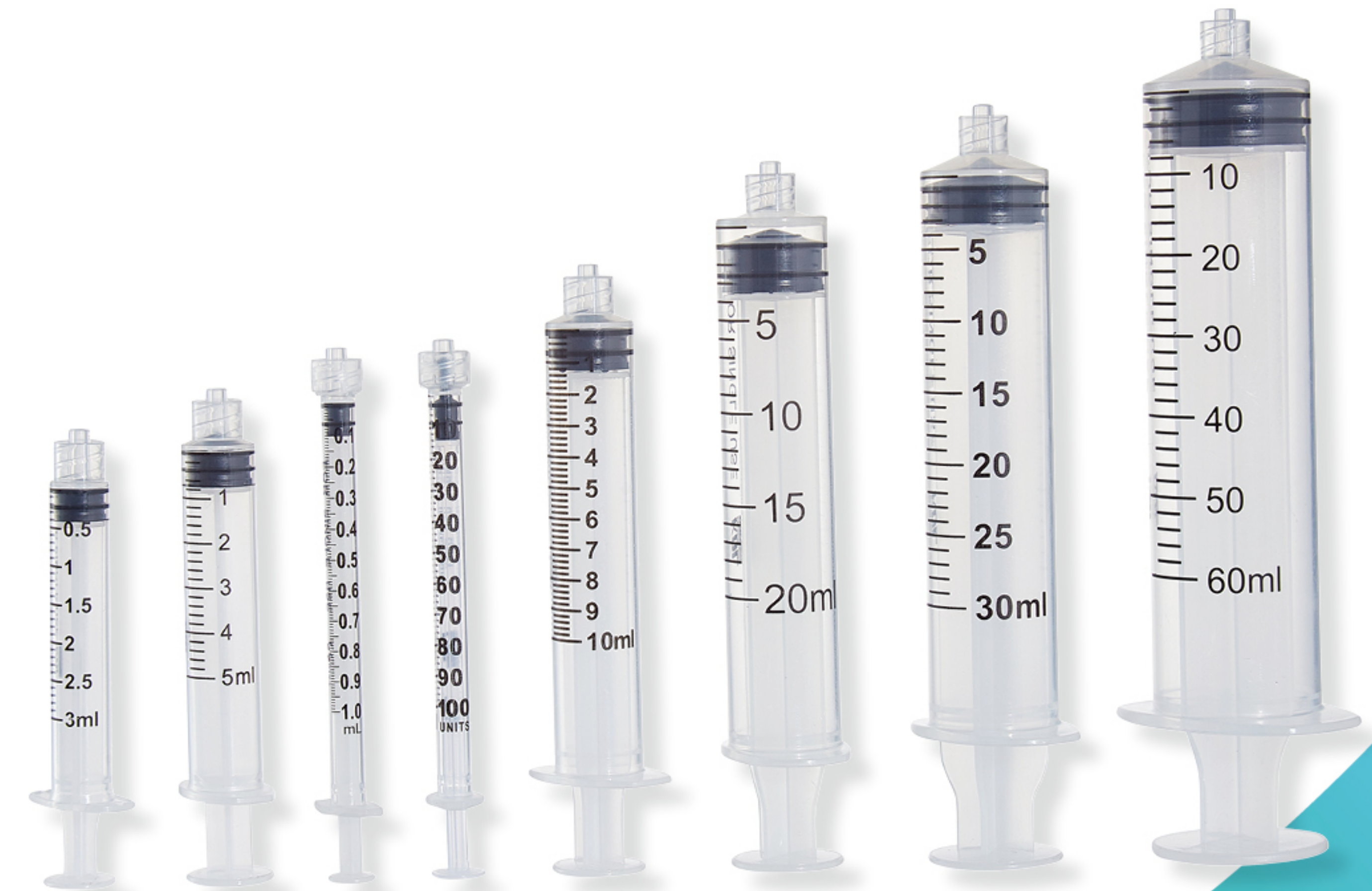
Sterile Syringes for Single Use (Luer Lock)