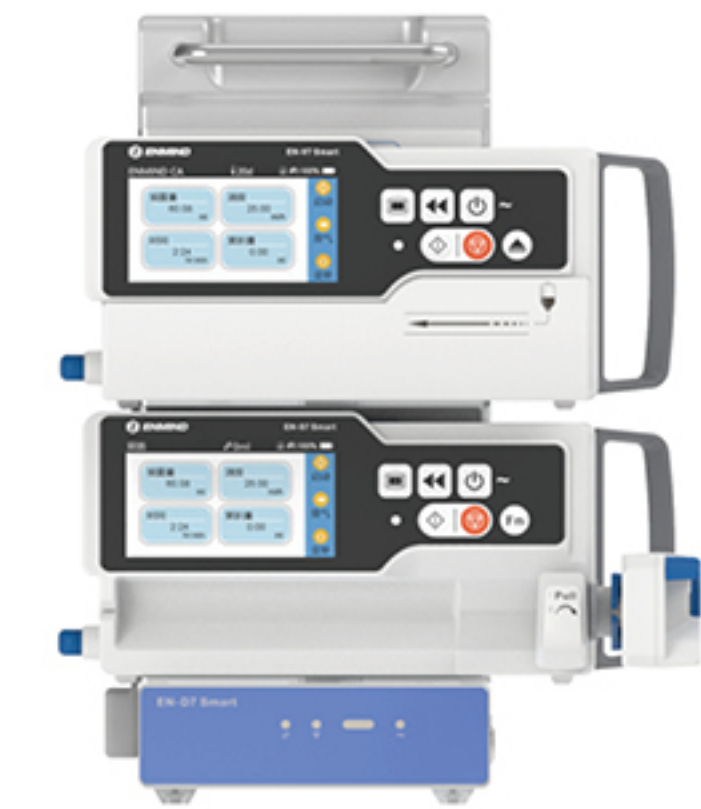
Suitable to be connected with power-driven syringe pumps